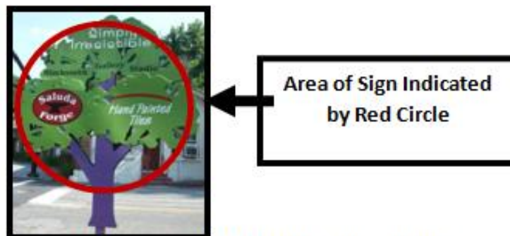
Example Illustrating Measurement of the Area of an Irregularly Shaped Sign

SIGN AREA. The size of a sign in square feet as computed by the area of not more than two standard geometric shapes (specifically circles, squares, rectangles, or triangles) that encompass the shape of the sign exclusive of the supporting structure.